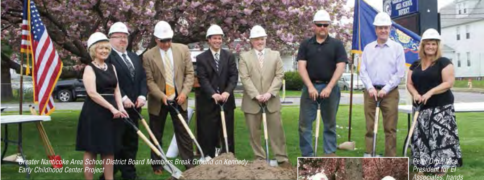
Greater Naticoke Area School District Board Members Break Ground on Kennedy Early Childhood Center Project