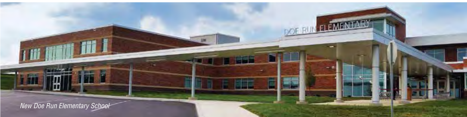
New Doe Run Elementary School