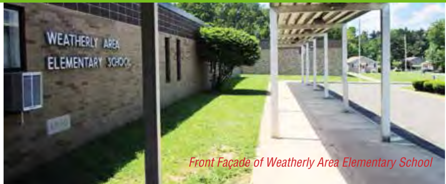
Front Façade of Weatherly Area Elementary School