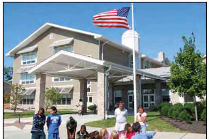
Summerfield Elementary School, NJ's 1st LEED® Gold Certified Public School