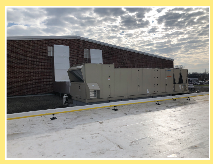
New Rooftop HVAC Equipment

The Union Township School District will receive Phases II and III ESSER Grants which are being used to fund physical facility upgrades. Portions of Union High School will receive air conditioning along with significant mechanical and ventilation upgrades. Burnet Middle School will also receive air conditioning and new ventilation systems and its kitchen and cafeteria will be upgraded and improved. A significant portion of Burnet Middle School will also be reroofed. In addition six other schools in the District have been reroofed as part of an ongoing ESIP program.